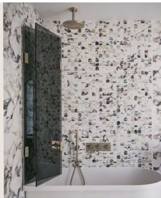
Diptych bi-fold bath screen is designed so that it can fold to the wall.

Our Diptych bi-fold bath screen glides into a discreet inward folding position, allowing for flexible bathing and showering.