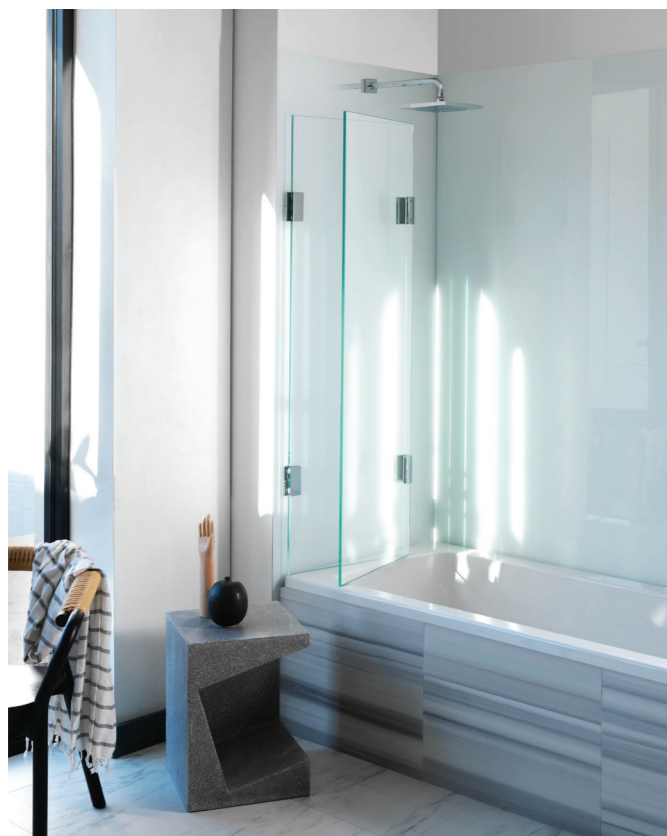
Diptych bi-fold bath screen is designed so that it can fold flat to the wall.

Our Diptych bi-fold bath screen glides into a discreet inward folding position, allowing for flexible bathing and showering.