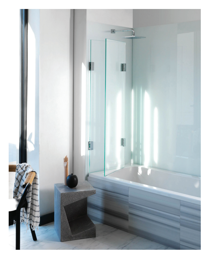
Diptych bi-fold bath screen is designed so that it can fold flat to the wall.

Our Diptych bi-fold bath screen glides into a discreet inward folding position, allowing for flexible bathing and showering.